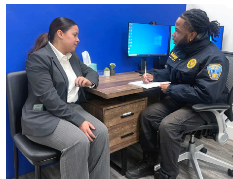
Brooklyn Legal Services A and NYC Department of Buildings partner to provide monthly services to homeowners from the Council District 45 office.

For more information on the housing services provided, please contact my office or to visit us on Wednesdays between 10 AM - 4 PM.