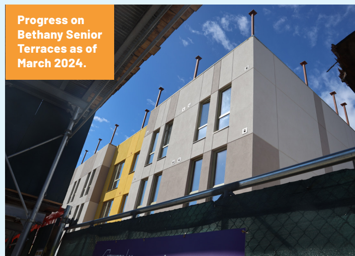
Progress on Bethany Senior Terraces as of March 2024.