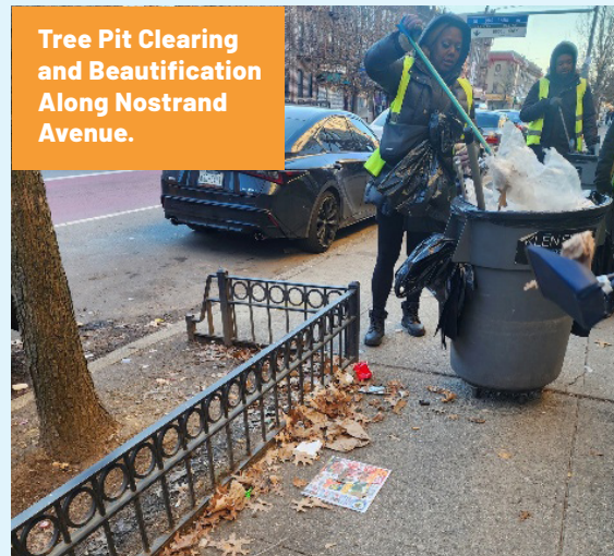
Tree Pit Clearing and Beautification Along Nostrand Avenue.