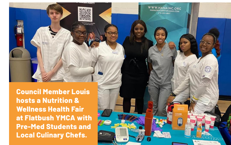
Council Member Louis hosts a Nutrition & Wellness Health Fair at Flatbush YMCA with Pre-Med Students and Local Culinary Chefs.

I have made strides in advocating for continued investment in our healthcare systems, especially for women facing disparities in maternal and mental health treatment across our City, and am looking forward to pushing forward new legislative and budgetary initiatives to keep our families safe.