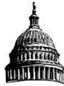
Nydia M. Velázquez Congresswoman