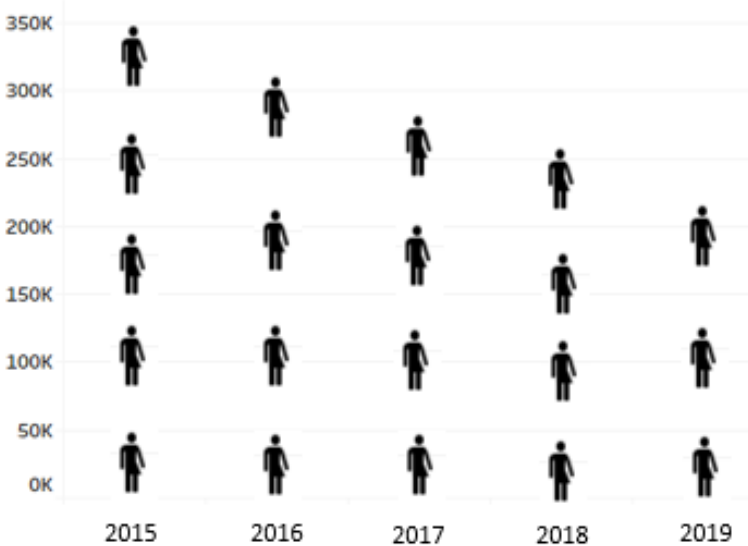
Indigent Defense Providers Case Intake 2015-2019