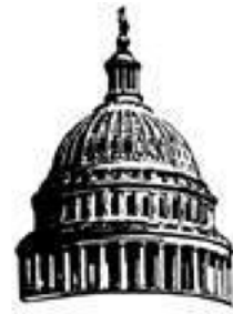
Nydia M. Velázquez Congresswoman